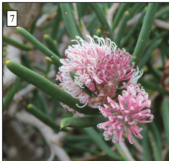
Photo 7: The needle like point on the leaves gives an indication of how prickly Hakea clavata is.

Photo 6: A closer view of the inflorescence.